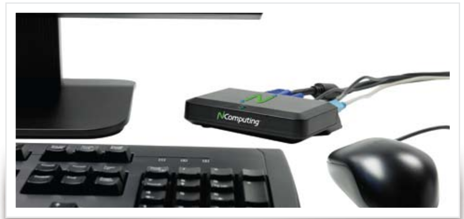
The X350 and the X550 are ideal for business, government, public access, classrooms, and computer labs.

Up to eleven users on one PC? Absolutely—today’s PCs are so powerful that the vast majority of people use only a small fraction of their available computing power. The X-series taps the unused capacity so that up to eleven users can simultaneously share a single PC. Each user gets their own virtual workspace (applications, settings, files, and preferences), but at a fraction of what it would cost with individual computers. So even though eleven people share a single system, they each get their own rich PC experience.